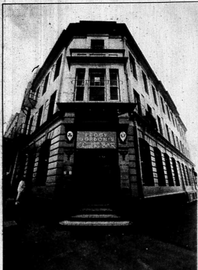
OPEN DOOR: The doors will be open to everyone, says bar owner Bertie Burleigh.