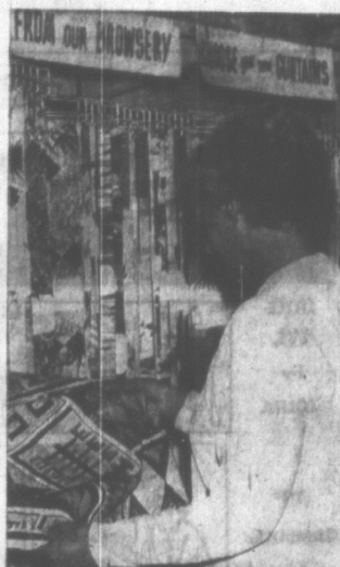
A CUSTOMER inspects contemporary curtaining in the "browsers."

A child-size armchair being produced in Britain serves a dual purpose. It can be quickly converted into a leg rest when not in use. Made from beech wood and upholstered in a variety of colours, this mini-chair is made with the same craftsmanship as larger ones, and will allow a child from two to 14 years to sit in comfort. Cost: 25 19s 6d.