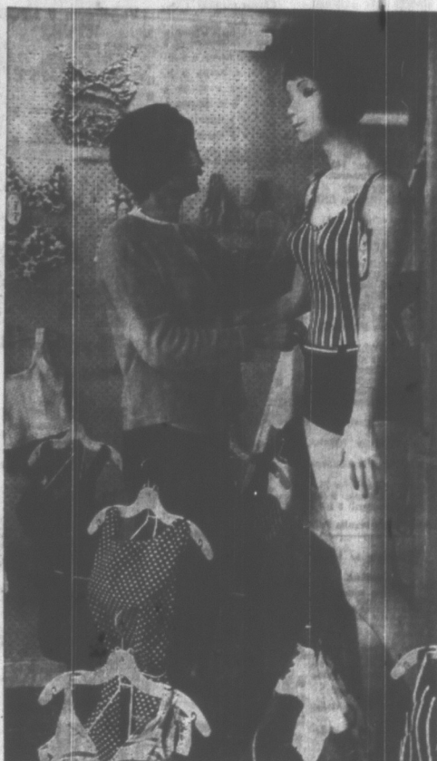
THE MODEL, looking larger than life, is fitted for a swimsuit by Miss B. M. Leslie, who is putting the finishing touches to an attractive window display of beach wear.