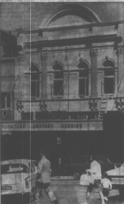
THE newly-renovated store of C. S. Lucas (New Plymouth) Ltd in Devon St West. Behind the old facade a remodelled interior incorporates modern self-service features. The ground floor is occupied with clothing, children's wear, haberdashery, curtaining and bedding, and the first floor with furniture and linoleum.

Taking a stroll through the newly renovated store of C. S. Lucas (New Plymouth) Ltd it can be seen that modern retailing trends have been followed, particularly in the drapery section.