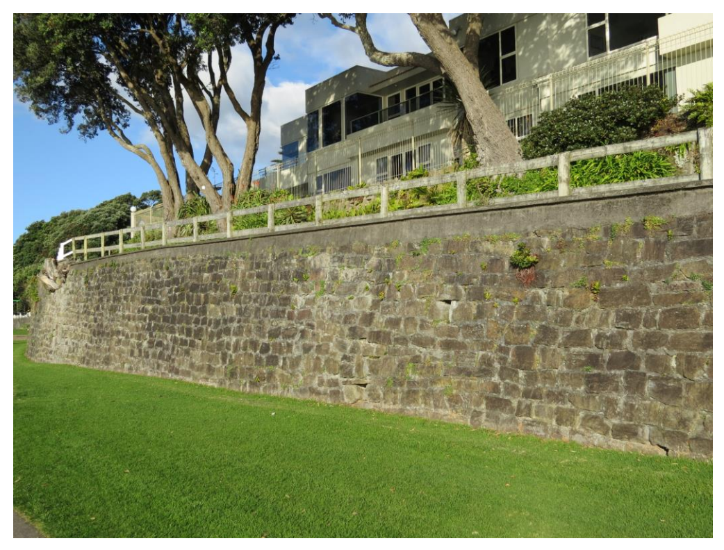
Retaining wall looking east towards playground area