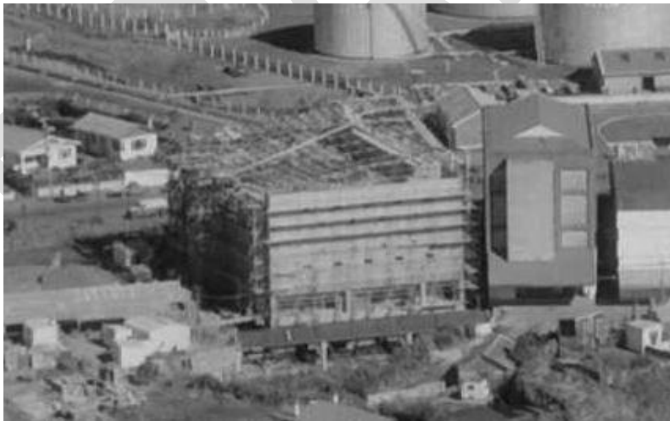
Parsons Store under construction, 22 August 1958.