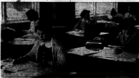
STAFF of the Taranaki Herd Improvement Association at work in the association's new offices.

In its area between Walkawau, north of Awakino, to between Maxwell and Kai-iwi in the south, and west as far as the Tangararau Gorge, the association tested more than 54,000 cows last season and expects to have an average of 219 pounds of butterfat per cow this season. This will be the highest figure reached by any association. More than 14,000 cows have been artificially inseminated.