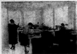
The use of natural lighting is illustrated in this view of the Herd Improvement Building's spacious and airy main office—a perfect example of today's imaginative and progressive building trends.