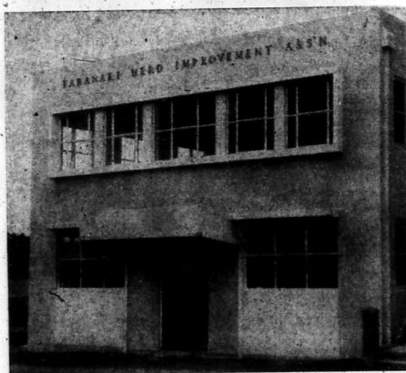
THE TARANAKI HERD IMPROVEMENT ASSOCIATION'S new building in St. Aubyn Street, New Plymouth, next to the Devonport Flats.