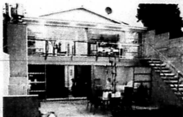
SUMMER DELIGHT: Auckland-based Grant Boniface Architect won a residential award and a colour award for this Urenui bach.