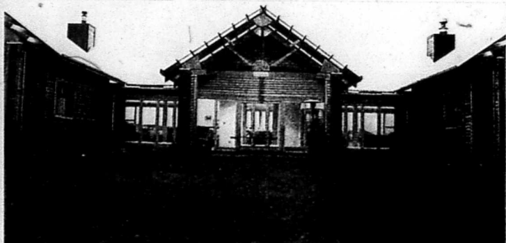
FUNCTIONAL LODGE: The Taranaki Country Lodge was designed by Elliot Architects and won an award in the hospitality and tourism category.