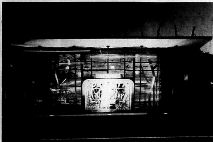
WINNING STYLE: The New Plymouth bus centre, designed by Boon Goldsmith Bhaskar Team Architecture, won a community and cultural award.

"The tailored responses we saw to client needs and wishes were, in some instances, surprising, and quite stunning."