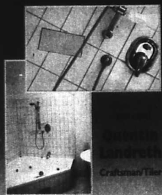
Quentin installed the tiles in the bathrooms at the Nice Hotel & Bistro