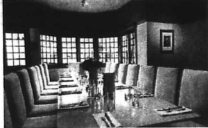
OPTIONS: Customised dining in private dining rooms.

As an introductory special and to celebrate the initial enthusiasm of the local market to their opening, the pair are offering special prices for luxury weekends for two at the nice hotel & bistro for the month of September, subject to availability.