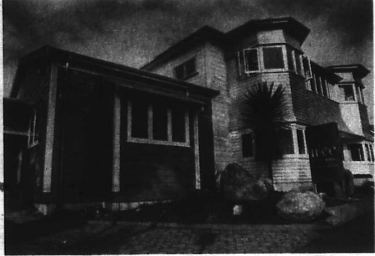
REBORN: Landscaping with a Taranaki flavour has detailed the already striking frontage of the Terry Parkes' and Chris Herlihy's nice hotel & bistro in New Plymouth.

... luxury weekend packages available. Treat you and your partner to an exquisite night in a comfortable and stylish bedroom with designer bathroom featuring double spa bath or massage shower. Enjoy Nice Bistro for dinner and to start the next day enjoy a delicious breakfast in the morning on our tropical deck.