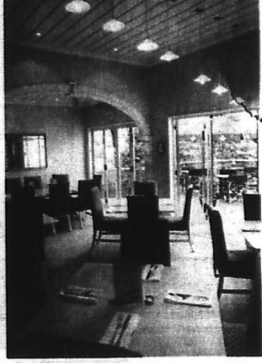
STYLE-SETTER: The main dining area of the nice hotel & bistro opens to a garden deck.

Luxurious dining and surroundings require a fine wine.