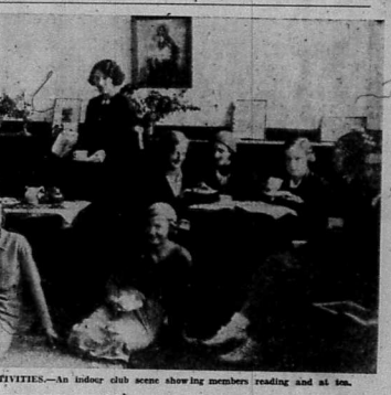
A PHASE OF THE Y. W. - Y. M. C. A. ACTIVITIES.—An indoor club scene showing members reading and at rest.

FARMERS requiring Men or Boys for Farm Work can rely on the Taranaki Herald, with its extensive local and country circulation, to assist in fulfilling their wants.—Use the Herald Wanted Column.