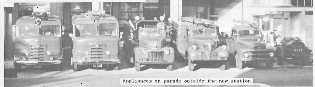
Appliances on parade outside the new station