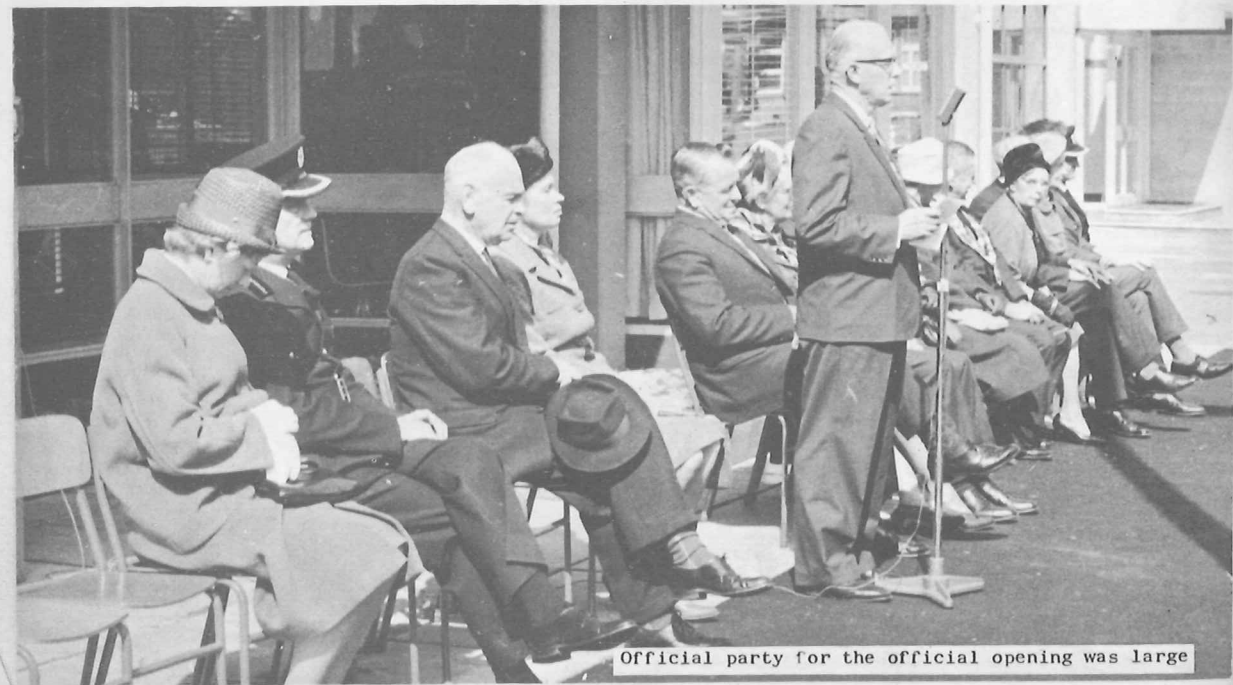
Official party for the official opening was large