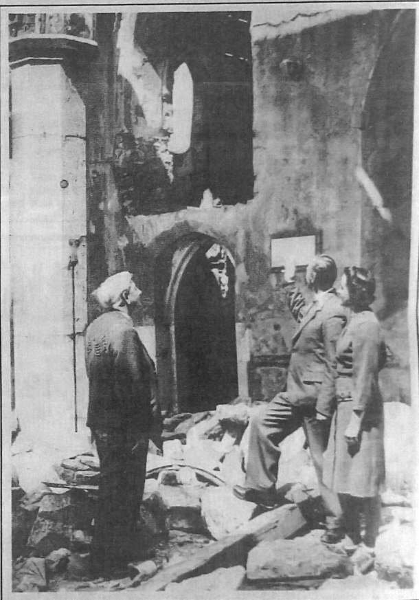
RIGHT: Plymouth Lord Mayor Issac Foot discusses the damage caused by a German bomb in 1941 with Miss D. Marfell and the St Michael's Church vicar, in Devonport, England. The bell tower was wrecked but the bomb-scarred bell was retrieved and still displays shrapnel splinters in it. The bell was later given to New Plymouth's Westown School by the people of Plymouth. The school is keen to track down the bell's more recent history to send back to England.