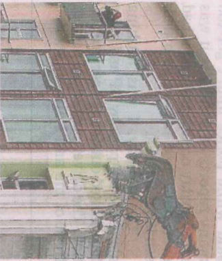
A bit closer? A man watches the demolition work.

Peter Tennent, who owns the Masters plot, said: "The plan is to put an upmarket apartment building on the site. It will be run in conjunction with the Devon Hotel."