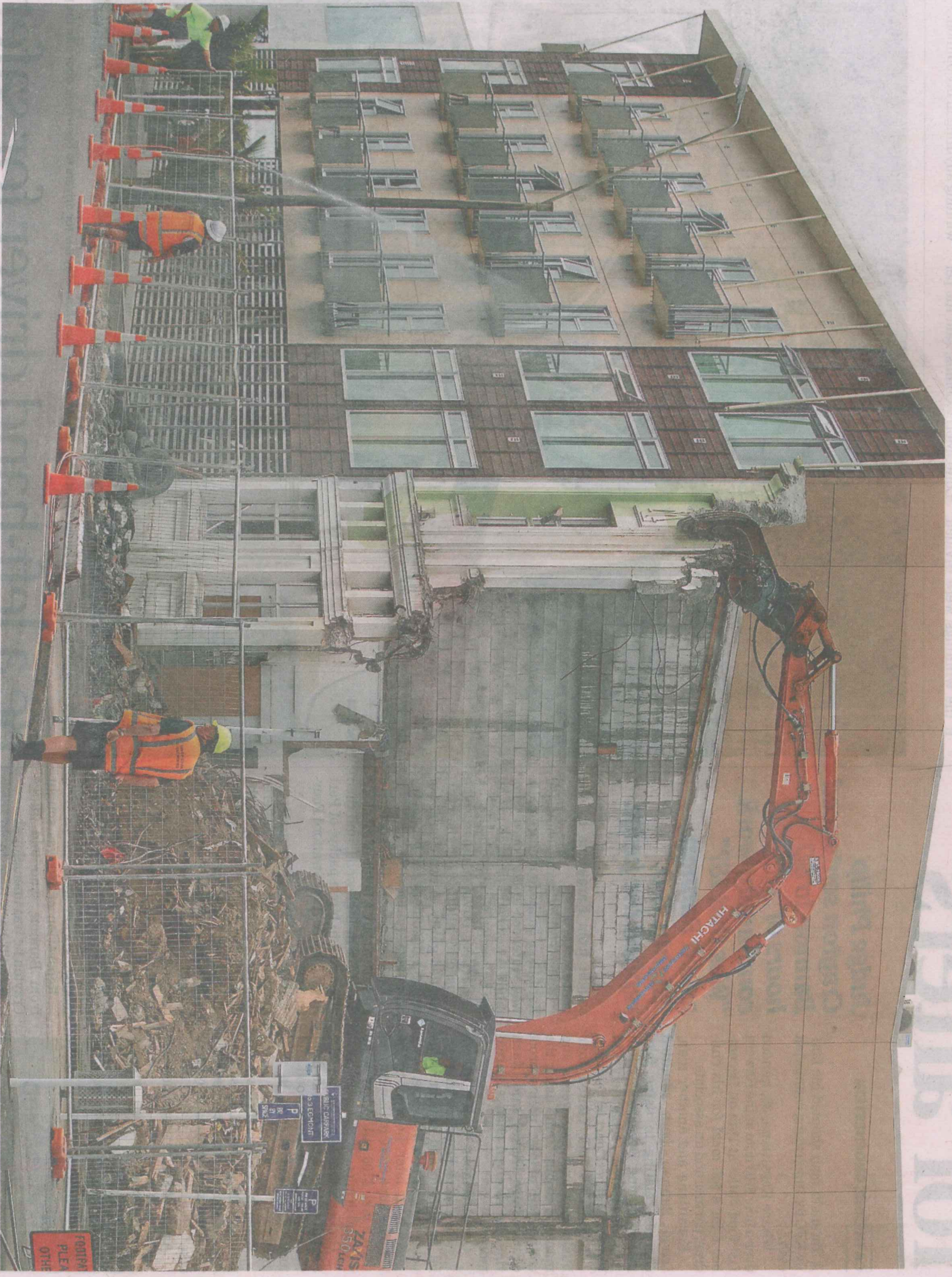
The Masters building on Egmont St in central New Plymouth is pulled to the ground.