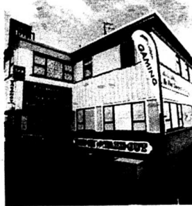
The New Commercial Hotel was built in 1896, and rebuilt in 1953.

and road makers often stay in the accommodation upstairs.