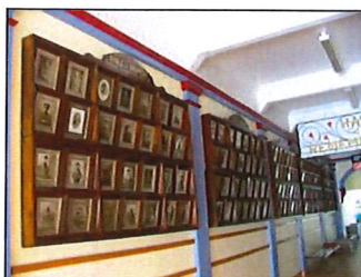
Left: World War One Photos Right: World War Two Photos