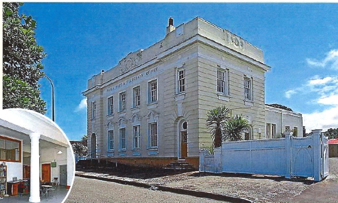
The Pātea Post Office and Telegraph Office building is for sale for less than most homes... and there is plenty of space inside (inset).

The old post office had been used as a private residence and a