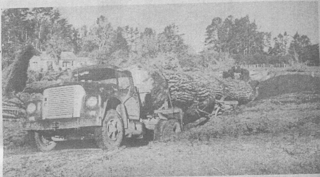
Removing trees from Becklands - the log, pictured, was 50 foot long weighing over 25 ton and it was loaded onto the truck from a hole 66 foot long and 8 foot deep. A 30 ton bulldozer was required to get the truck up onto level ground.

In recent years the large trees on the property were cleared, and the property which is a portion of the original Becklands is currently for sale.